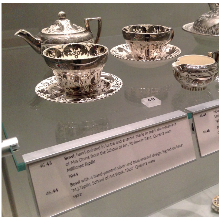
Wedgwood Museum, Stoke on Trent, UK.